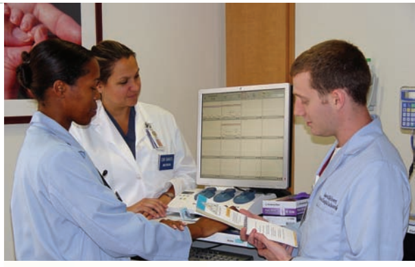
Patient Safety - Cont.